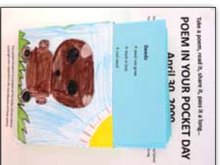
Lyla, First Grade