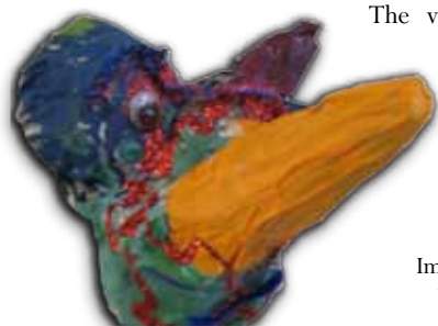
Imaginary birds throughout by the Second Grade